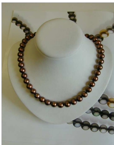
Necklace 2: Tahitian Chocolate Pearl Necklace 9 x 9 mm pearls, 18" strand, 14 karat gold clasp, includes appraisal by independent gemological laboratory