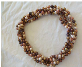
Necklace 4: Chocolate and Champagne Freshwater Cultured Pearl Necklace (also on Valerie in photo above) 8 - 9 mm pearls, 70" rope strand, no clasp, can be worn multiple ways including

From chocolate tours of the finest chocolate shops, to the finest luxury chocolate pearls: Chicago Chocolate Tours introduces our line of fine chocolate pearl jewelry!