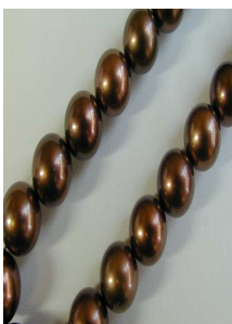
Necklace 1: South Sea Chocolate Cultured Pearl Necklace (also on Karla in photo at top of page) 14 - 12 mm pearls, 18" strand, 14 karat gold clasp, includes appraisal by independent gemological laboratory

For more information or to purchase any of our perfect holiday gifts, please see www.chicagochocolatetours.com/gifts or contact us at 312-929-2939 or info@chicagochocolatetours.com .