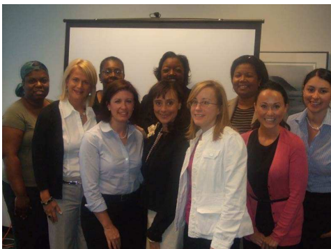
Tuesday, December 14: Celebrate the season in style with NAWBO - National Association of Women Business Owners,

A quick calendar of events to save and crave