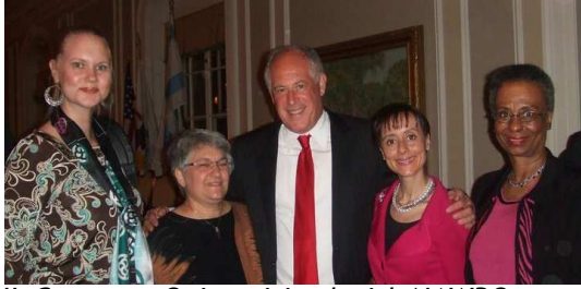
IL Governor Quinn visited with NAWBO members in August and is invited to speak at the NAWBO DAY luncheon October 14.

Saturday, October 16: Happy Sweetest Day! For tour schedules on Sweetest Day weekend and beyond, see above or click here!